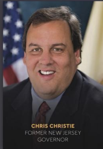
CHRIS CHRISTIE FORMER NEW JERSEY GOVERNOR

A DISCUSSION ON POLITICS, THE STATE OF PUBLIC DISCOURSE IN THE U.S., AND THE NOVEMBER ELECTIONS